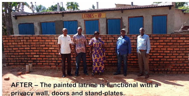
AFTER – The painted latrine is functional with a privacy wall, doors and stand-plates.

They can be mailed to the parish office or turned in at Mass in the offertory basket at the baptismal fonts at 106th or 116th Street sites.