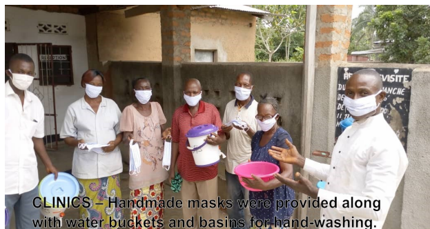
CLINICS – Handmade masks were provided along with water buckets and basins for hand-washing.

Turned in at Mass in the offertory basket at the baptismal fonts at 106th or 116th Street sites