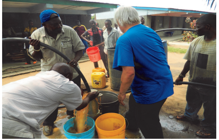
Well Drilling and maintenance at the Schools