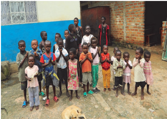
Children from one of the two Orphanages