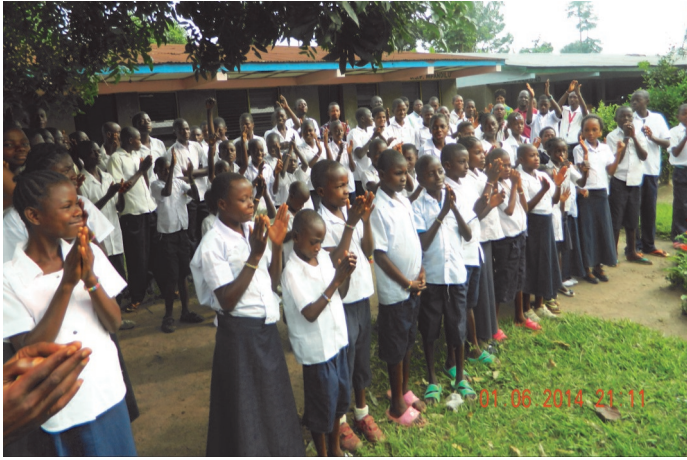
MPANDILU Centers for Blind/Deaf Children