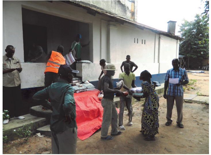
Food and Tool distribution Point