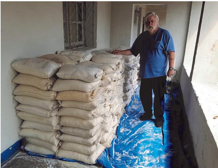
Emergency Food purchased with your help