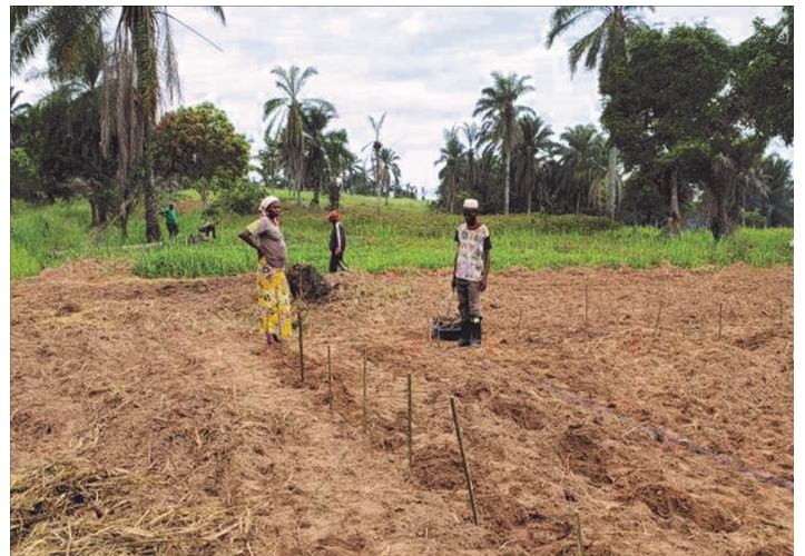
Family Farming begins again