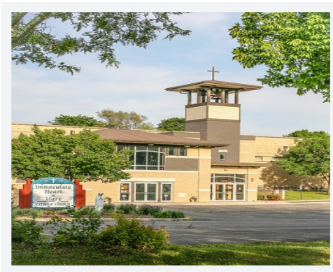
116TH STREET SITE 1212 S. 117th Street