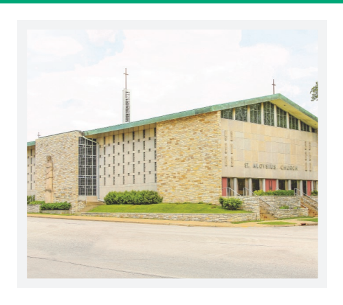
92ND STREET SITE 1414 S. 92nd Street