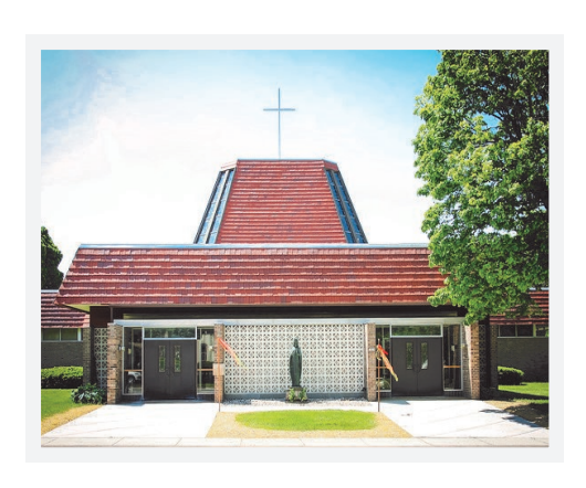
106TH STREET SITE 2322 S. 106th Street