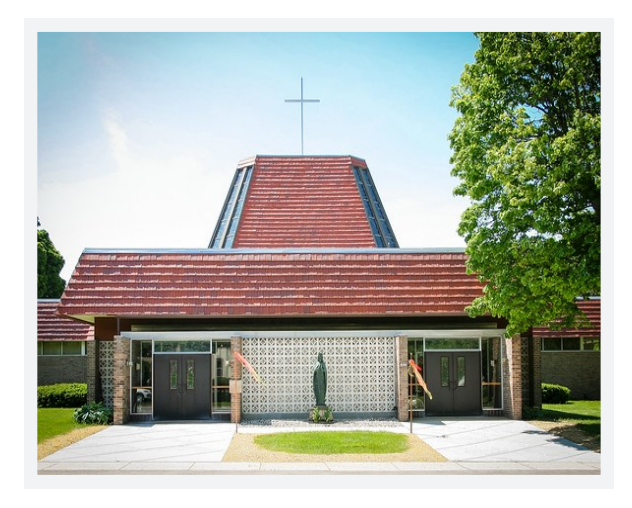
106TH STREET SITE 2322 S. 106th Street