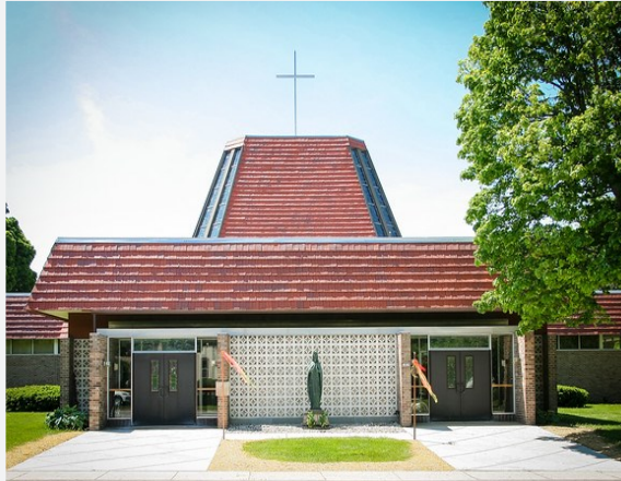
106TH STREET SITE 2322 S. 106th Street