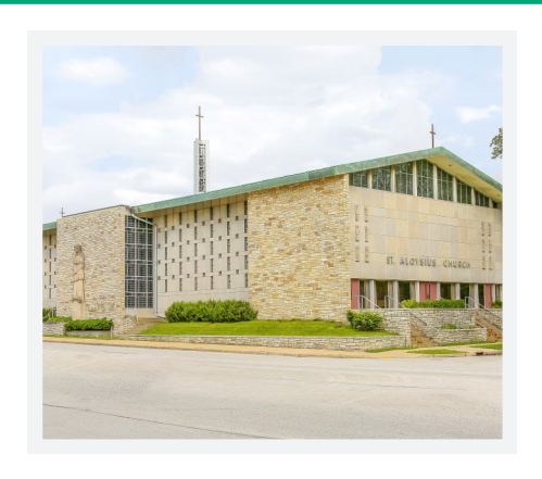
92ND STREET SITE 1414 S. 92nd Street