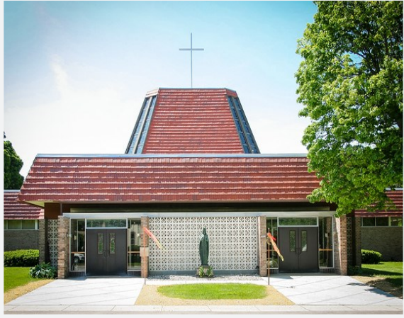
106TH STREET SITE 2322 S. 106th Street