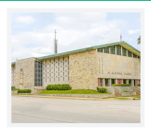
92ND STREET SITE 1414 S. 92nd Street