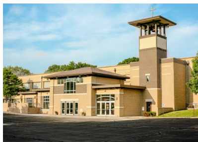
MPH WEST 1212 S. 117th Street