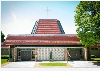
MPH EAST 2322 S. 106th Street