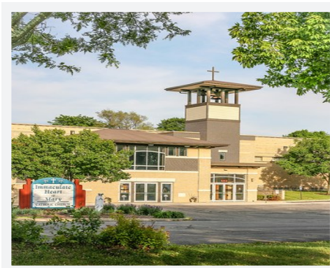
116TH STREET SITE 1212 S. 117th Street