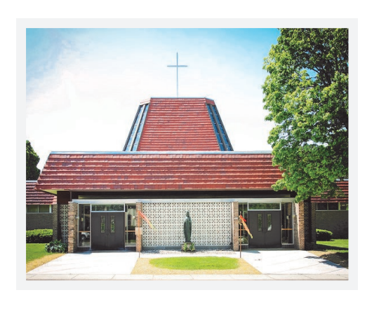
106TH STREET SITE 2322 S. 106th Street