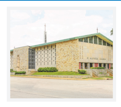
92ND STREET SITE 1414 S. 92nd Street