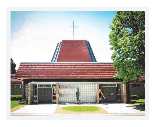
106TH STREET SITE 2322 S. 106th Street