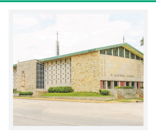
92ND STREET SITE 1414 S. 92nd Street