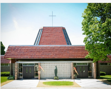
106TH STREET SITE 2322 S. 106th Street