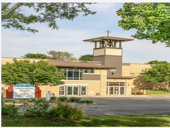
WEST SITE 1212 S. 117th Street

First Saturday: 8:00 am (East Site 106th St.)