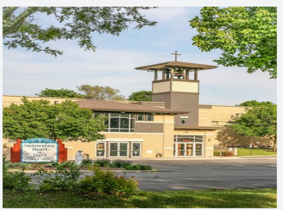
WEST SITE 1212 S. 117th Street

First Saturday: 8:00 am (East Site 106th St.)