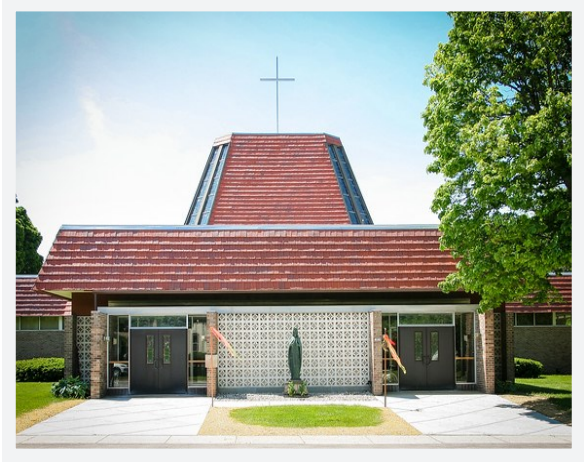
EAST SITE 2322 S. 106th Street