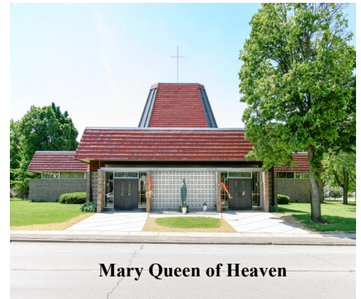
Mary Queen of Heaven