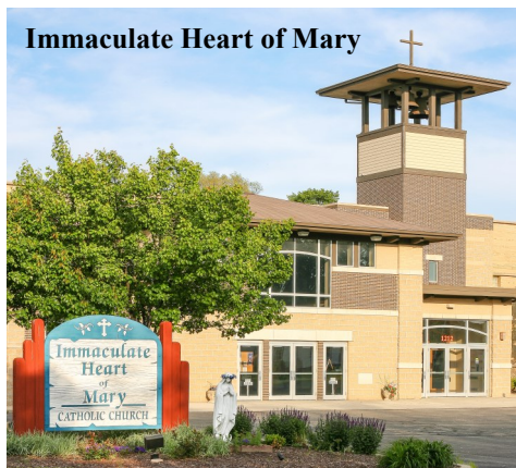
Immaculate Heart of Mary

Acknowledging the contributions of all who built our Faith Community