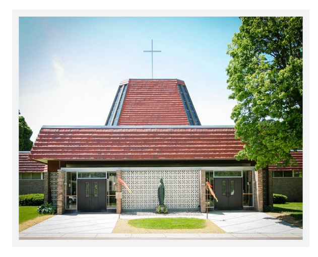
106TH STREET SITE 2322 S. 106th Street