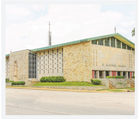
92ND STREET SITE 1414 S. 92nd Street