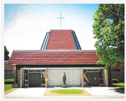
106TH STREET SITE 2322 S. 106th Street