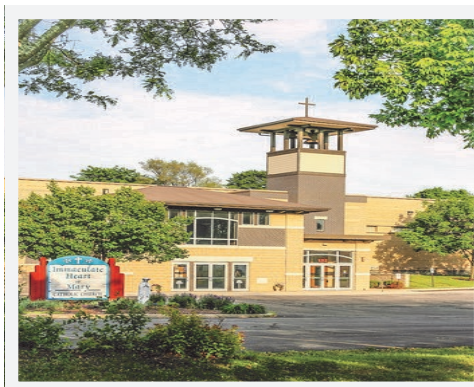
116TH STREET SITE 1212 S. 117th Street