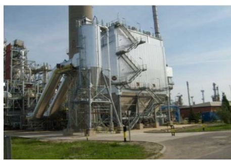
Air Pollution Control