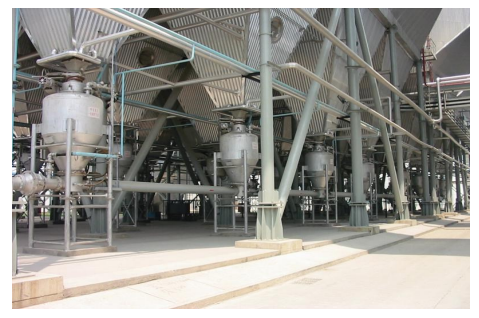
Dry Bulk Handling