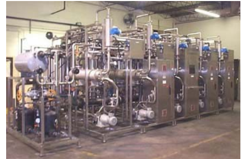
C.I.P. / Sanitation