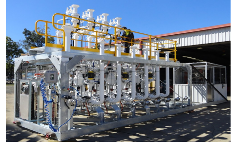
Loading / Unloading