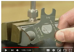
The Other Guys (Warranty Requires Special Tool)