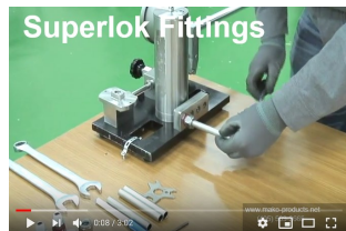
Installation & Burst Test