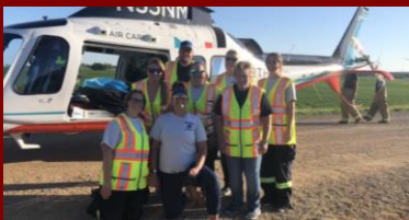
Facebook Group: Ivanhoe Ambulance