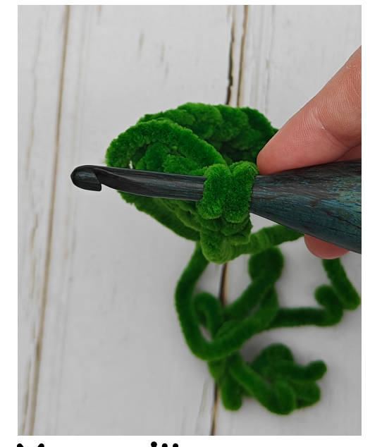
3. You will now have 2 loops on your hook