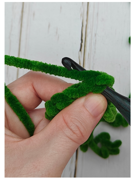
2. Put the yarn over your hook and pull the hook back through the stitch