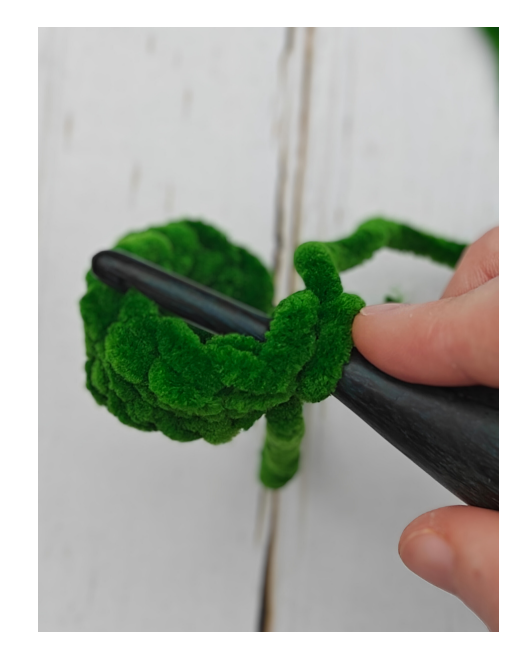
1. Put your hook into the stitch