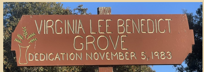
Virginia Lee Benedict Grove Marine Stadium Park, dedicated 11/5/1983