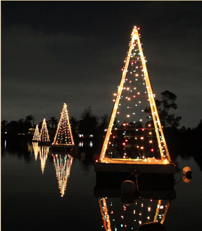
Holiday Trees in the Colorado Lagoon

Lighting the floating holiday trees in the Colorado Lagoon the day after thanksgiving has been a cherished tradition in Alamitos heights since 1988. This year was the 35th anniversary of the tradition and it was the biggest and best celebration yet!