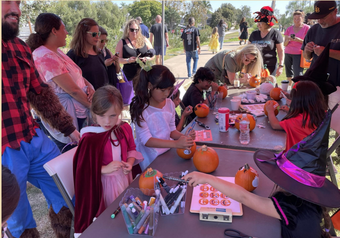
Children decorate "mini pumpkins" at the AHIA booth during Goblins on the Green Belt.