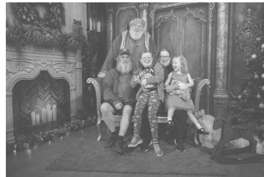
Photo: My family and I at Christmas with Father Christmas (Oldewinter)

It's been an absolute joy to see the village grow from a small mining village to a continually growing and welcoming modern town. I love the inclusivity of our community and how supportive we can be and it's a pleasure to be able to assist in advertising and signposting people to all the amazing events that we have going on. I look forward to continuing my role and am excited to see what we achieve in the future together. Thanks for having me on board! – Gayle x"