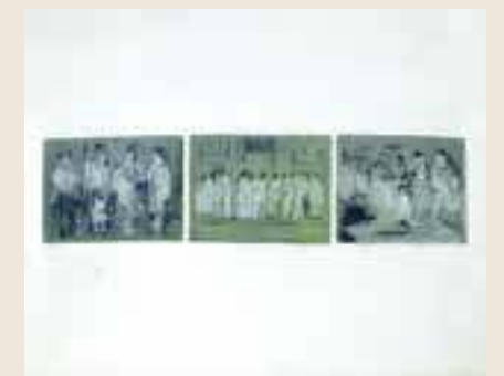
1048 Buen Calubayan (b. 1980) Fressie Capulong 16 dated 2012 oil on paper 18" x 22 1/2" (46 cm x 57 cm)