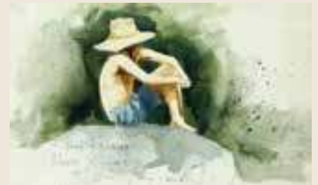
1053 Jun Tiongco (b. 1957) Untitled signed (lower left) watercolor on paper 6 1/2" x 10 1/2" (16 cm x 26 cm)