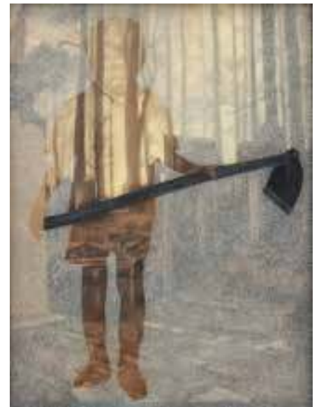
1063 Leonardo C. Onia Jr. (b. 1986) Untitled signed oil on canvas and acrylic on glass 48" x 36" (122 cm x 91 cm)