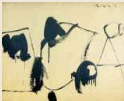
1044 Angelito Antonio (b. 1939) Sonata 6 signed and dated 2013 (upper right) enamel on paper 22 1/2" x 28 1/2" (57 cm x 72 cm)