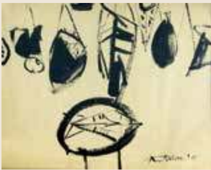
1043 Angelito Antonio (b. 1939) Sonata 14 signed and dated 2013 (lower right) enamel on kraft paper 22 1/2" x 28 1/2" (57 cm x 72 cm)