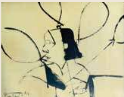
1046 Angelito Antonio (b. 1939) Untitled signed and dated 2013 (lower left) pen and ink on paper 20" x 26" (51 cm x 66 cm)