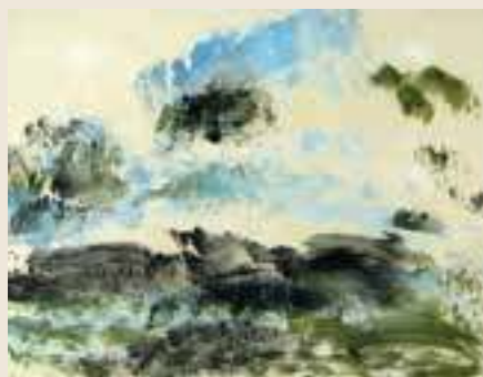
1047 Juvenal Sansó (b. 1929) Lapping Waters signed (lower right) gouache on paper 9 1/4" x 12" (23 cm x 30 cm)