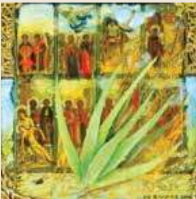
1051 Mario De Rivera (b. 1953) Landscape with Aloe signed and dated 2006 (lower right) mixed media 12" x 12" (30 cm x 30 cm)