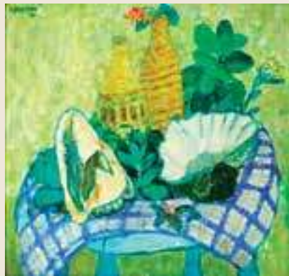
1052 Antonio Austria (b. 1936) Still Life signed and dated 1980 (upper left and verso) oil on canvas 13" x 13 3/4" (33 cm x 35 cm)