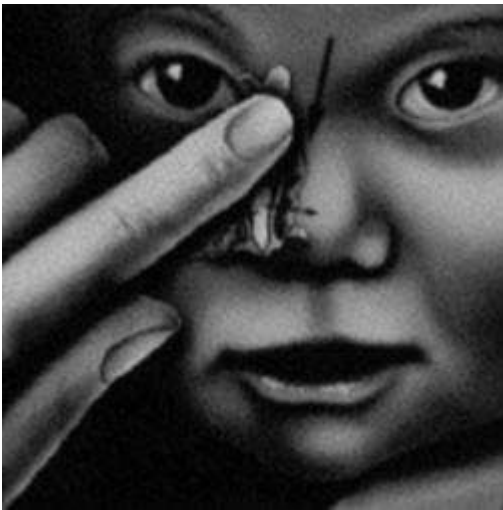
Fig. 2: Tear duct massage is performed by applying firm pressure in a downward motion.

duct, located medially to the eye (see Figure 2). The pressure push the mucus and tears out through the puncta to prevent infection in the tear duct. It may also help open the membrane that blocks the tear duct at the opening in the nose. This is called the Crigler massage.