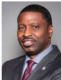
Derrick Johnson President and CEO NAACP