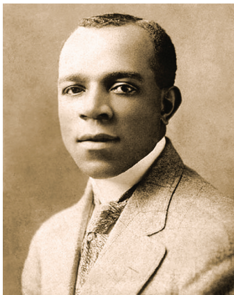
John Rosamond Johnson 1873 – 1954

Many people are surprised to learn that “Lift Ev’ry Voice and Sing” was first written as a poem. Created by James Weldon Johnson, it was performed for the first time by 500 school children in celebration of President Lincoln’s Birthday on 12, 1900 in Jacksonville, Florida. The poem was set to music by James’ brother, John Rosamond Johnson, and soon adopted by the National Association for the Advancement of Colored People (NAACP) as its official song. Today “Lift Ev’ry Voice and Sing” is one of the most cherished songs of the African American Civil Rights Movement and is often referred to as The Negro National Anthem .