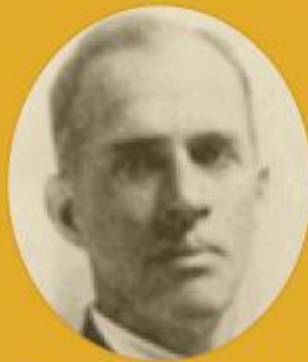
William English Walling