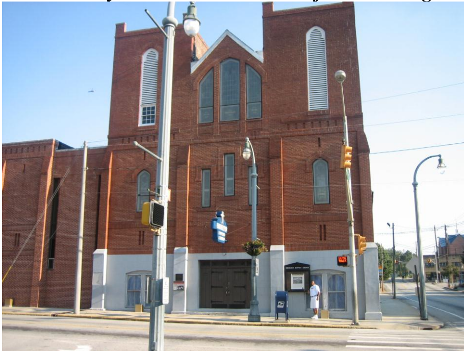
(Historic Ebenezer Baptist Church)

“The Church Will Always Be The Cornerstone of the Civil Rights Movement”