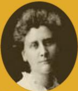
Mary White Ovington