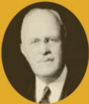
Oswald Garrison Villard