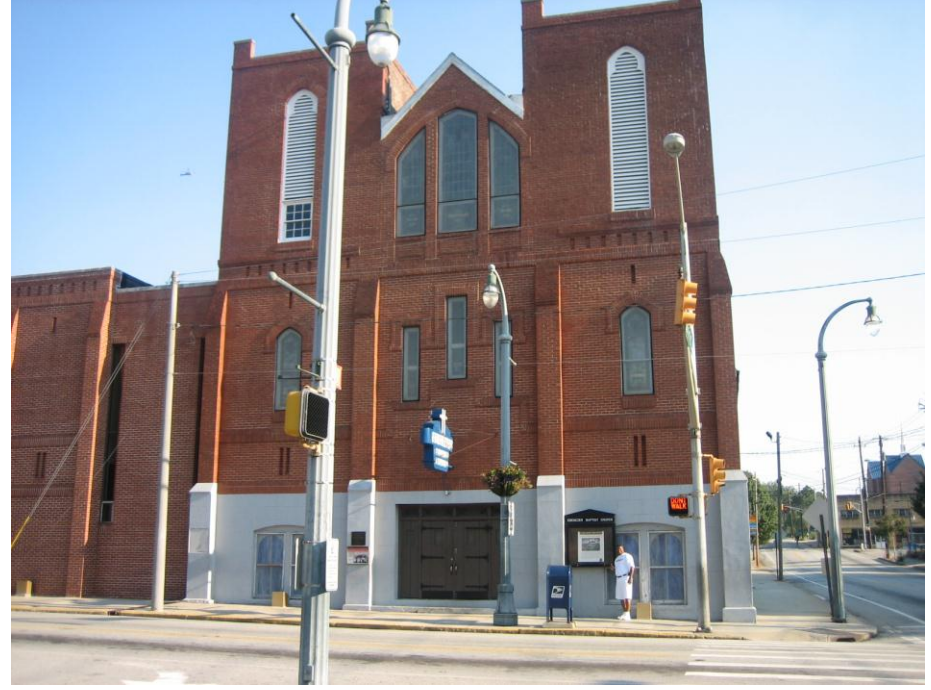
(Historic Ebenezer Baptist Church)