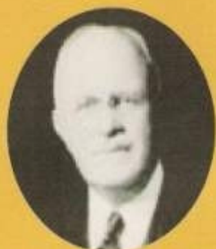
Oswald Garrison Villard