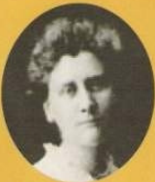
Mary White Ovington