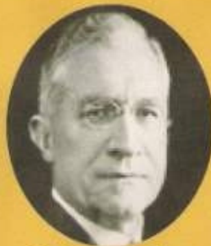
John Haynes Holmes