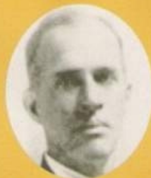
William English Walling