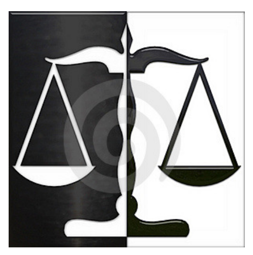
Seeking Equality of Rights For All Americans

Child Care - 1 Child Custody - 1 Criminal Justice - 34 Customer – 1 DNA Issues – 2 Education - 8 Employment - 68 Failure To Provide Medical Care - 4 Healthcare - 1 Housing – 7 Illegal Search & Seizure – 1 Juvenile Justice – 3 Labor - 1 Police Misconduct - 28 Race -30Release of Employment Records – 1 Religion - 1 Retirement – 1 School Administration – 2 Unemployment Benefits – 1 Unfair Treatment – 3 Zoning Law – 2