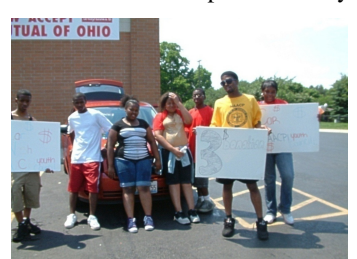
Dayton Youth Council