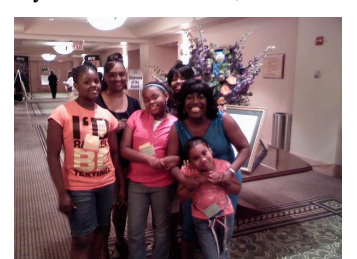
Littlejohn Junior NAACP Youth Council

We appreciate all of our sponsors who have assisted us in supporting our dynamic youth groups, The Littlejohn Junior Youth Council; The Dayton Youth Council; and The Dayton ACT-SO Youth Group. We thank you and are grateful for you investing in our youth.