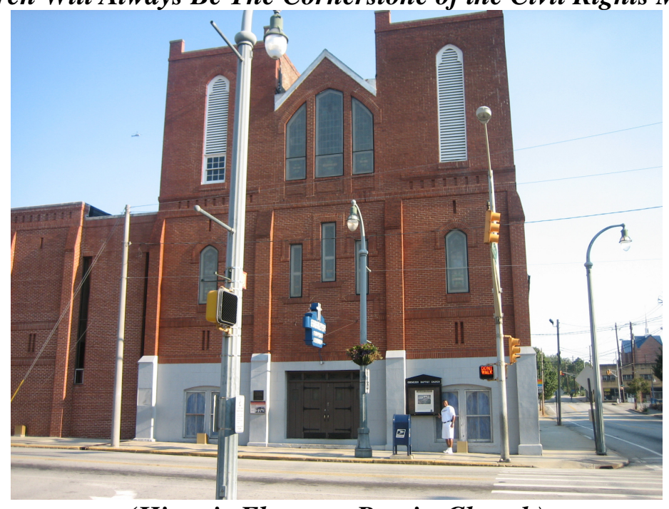
(Historic Ebenezer Baptist Church)

"The Church Will Always Be The Cornerstone of the Civil Rights Movement"