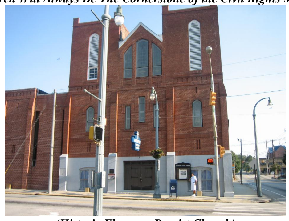
(Historic Ebenezer Baptist Church)

"The Church Will Always Be The Cornerstone of the Civil Rights Movement"