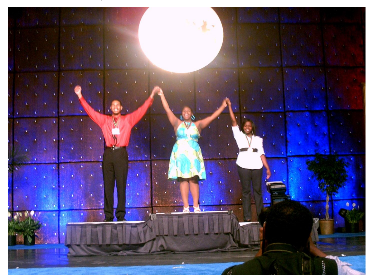
National NAACP ACT-SO Awards Ceremony