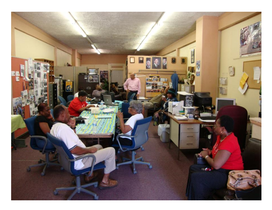
Citizens Sharing Their Concerns

The Dayton Unit NAACP hosted 4 Constituent Days, with a theme of "We Are One". Members of the Dayton Unit's Executive Committee listened to the citizens of the Greater Dayton Metropolitan Area about their thoughts on issues such as SB5, employment, education reform, etc.... The Dayton Unit NAACP collected the citizens' comments over each constituent day and then addressed the community and other key stakeholders with our call to action.