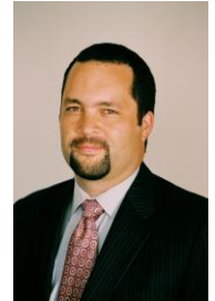
Benjamin Todd Jealous President and CEO NAACP