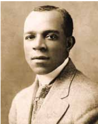
John Rosamond Johnson 1873 – 1954

Many people are surprised to learn that “Lift Ev’ry Voice and Sing” was first written as a poem. Created by James Weldon Johnson, it was performed for the first time by 500 school children in celebration of President Lincoln’s Birthday on 12, 1900 in Jacksonville, Florida. The poem was set to music by James’ brother, John Rosamond Johnson, and soon adopted by the National Association for the Advancement of Colored People (NAACP) as its official song. Today “Lift Ev’ry Voice and Sing” is one of the most cherished songs of the African American Civil Rights Movement and is often referred to as The Negro National Anthem .