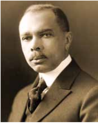
James Weldon Johnson 1871 – 1938