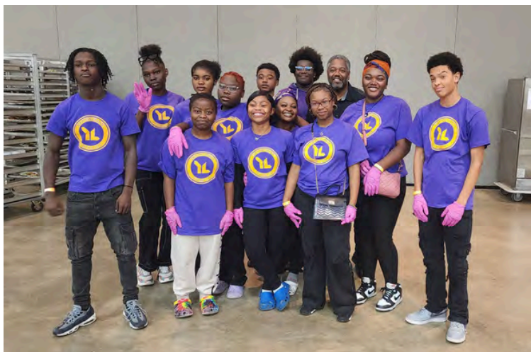
Dayton Urban Young Life Volunteered at the 73rd Dayton NAACP Hall of Freedom Awards