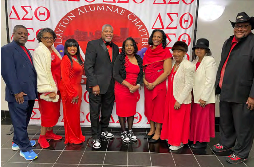
A couple is posing for a photo in a large, circular, gold-colored frame. The frame is decorated with pink fabric and white balloons. The man is wearing a black suit and the woman is wearing a teal dress. They are standing on a light-colored tiled floor in a room with white walls and a brown curtain in the background.