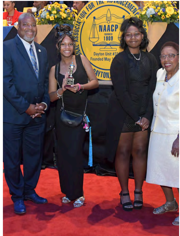
Community Service Award Young Ladies Aspiring Greatness