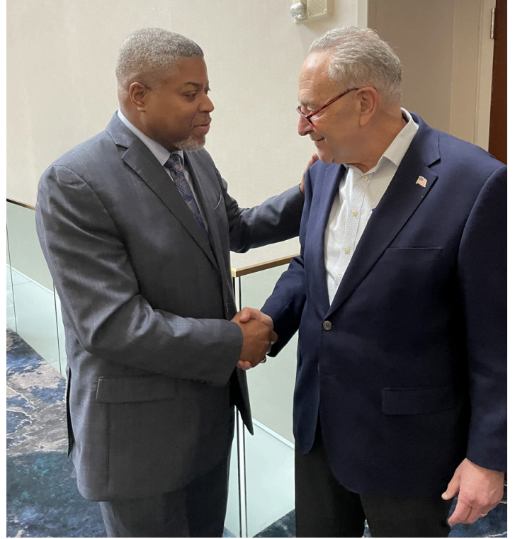
Foward and U. S. Senator Chuck Schumer Meet for the First Time During NAACP National Board Meeting in New York