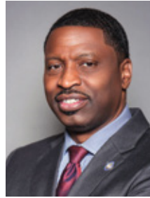
Derrick Johnson President and CEO NAACP