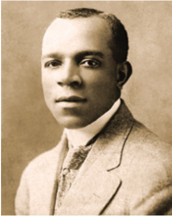
John Rosamond Johnson 1873 – 1954

Many people are surprised to learn that “Lift Ev’ry Voice and Sing” was first written as a poem. Created by James Weldon Johnson, it was performed for the first time by 500 school children in celebration of President Lincoln’s Birthday on 12, 1900 in Jacksonville, Florida. The poem was set to music by James’ brother, John Rosamond Johnson, and soon adopted by the National Association for the Advancement of Colored People (NAACP) as its official song. Today “Lift Ev’ry Voice and Sing” is one of the most cherished songs of the African American Civil Rights Movement and is often referred to as The Negro National Anthem .