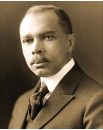
James Weldon Johnson 1871 – 1938

Music by John Rosamond Johnson, Composer and Actor