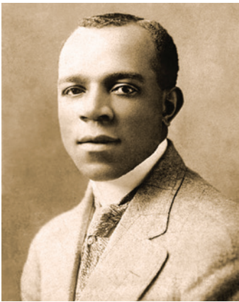
John Rosamond Johnson 1873 – 1954

Many people are surprised to learn that “Lift Ev’ry Voice and Sing” was first written as a poem. Created by James Weldon Johnson, it was performed for the first time by 500 school children in celebration of President Lincoln’s Birthday on 12, 1900 in Jacksonville, Florida. The poem was set to music by James’ brother, John Rosamond Johnson, and soon adopted by the National Association for the Advancement of Colored People (NAACP) as its official song. Today “Lift Ev’ry Voice and Sing” is one of the most cherished songs of the African American Civil Rights Movement and is often referred to as The Negro National Anthem .