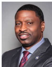
Derrick Johnson President and CEO NAACP