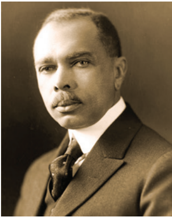
James Weldon Johnson 1871 – 1938