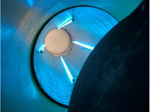
Make-Up Air & Exhaust Disinfection