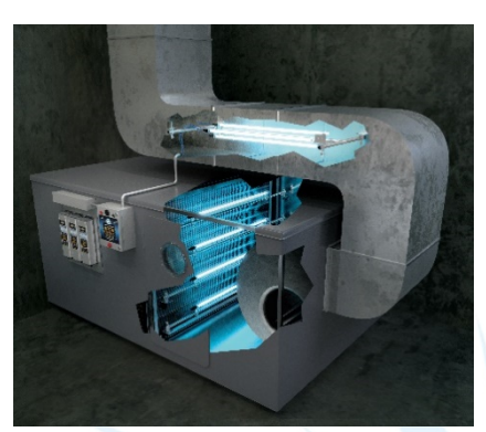
Air Handler & Airstream Disinfection