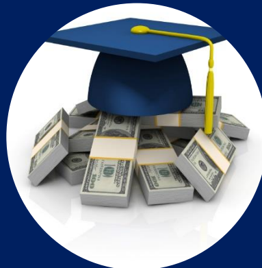
Tuition and fees