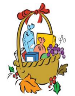
Thanksgiving Baskets for Helping Hands

To provide Thanksgiving meals to many who otherwise would not be able to celebrate this wonderful occasion; a list of what we need to collect for these