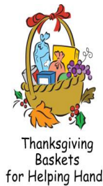
Thanksgiving Baskets for Helping Hands

+POSTLUDE “God Is Our Salvation” Nordman