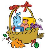
Thanksgiving Baskets for Helping Hands

It is that time of year again and we will need 12 turkeys for the Annual Christmas Candlelight Dinner scheduled for December 15 th . If you would like to donate a turkey or money to buy a turkey, please bring it by the church no later than December 8 th .