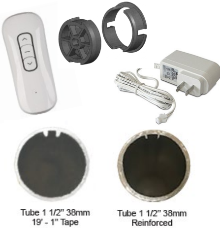
Tube 1 1/2" 38mm 19' - 1" Tape

Recommended max shade size 84"x84" (2.13 mts x 2.13 mts) (Calculated with Mermet Avila 0%)