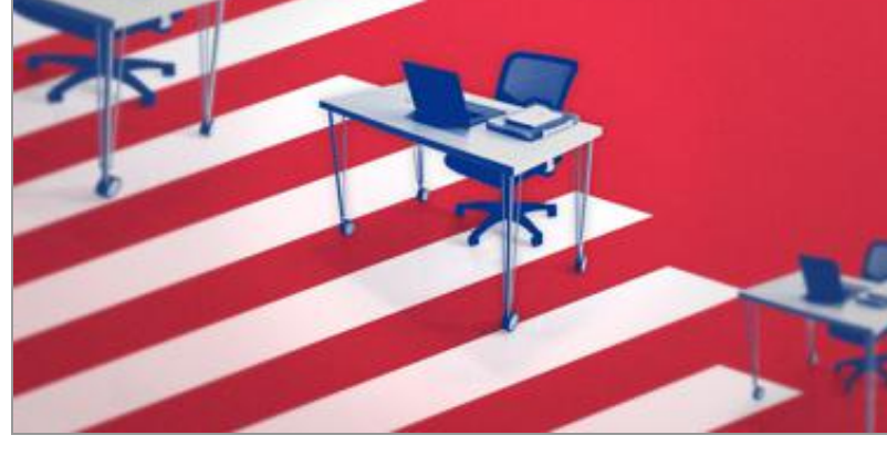
America's Best Midsize Employers