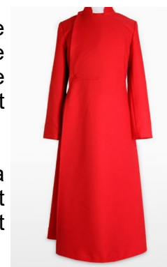
A choir Cassock