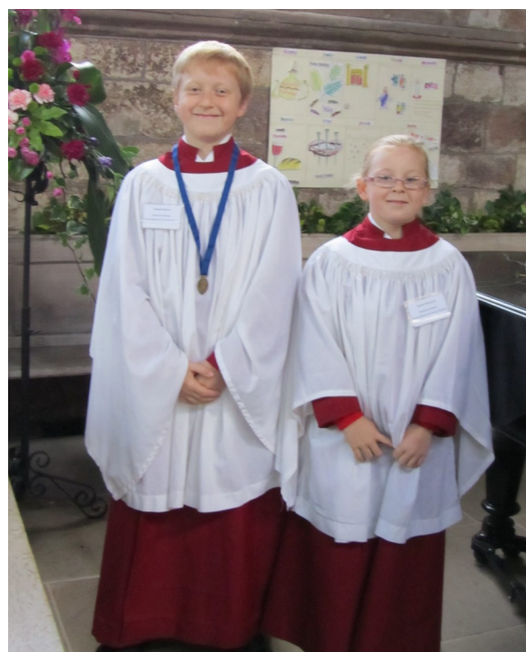
Two Rotherham Minster Choristers preparing to meet the queen's cousin, Prince Richard, Duke of Gloucester, when he visited the church in 2011.

If you have seen the famous Christmas services from King's College Cambridge, or heard them on the radio on Christmas Eve, you will know what a wonderful, inspiring and moving sound a group of well-trained and committed choristers can make.