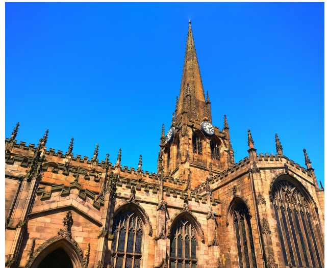
The 188 feet tall spire topped with a gilded weather-vane has overlooked the town for over 500 years.