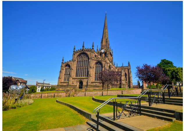
Rotherham Minster viewed from the West.

Previously known as the Parish Church of All Saints Rotherham, it was granted Minster status in 2004.