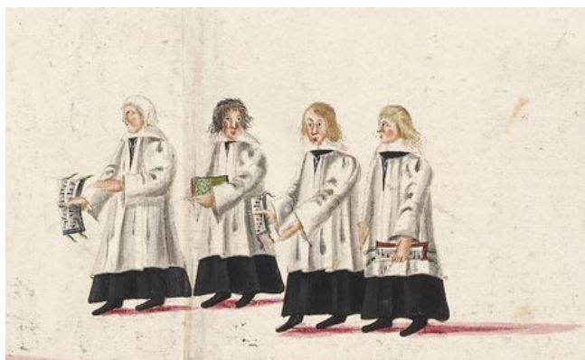
Choristers of the Chapel Royal in the Tudor period.

Choristers take an important part in church services, and have the same duties and responsibilities as adult choir members. As part of the choir, they help give a strong lead to congregational singing. To do this, they will learn a range of hymns and songs, both traditional and contemporary. They will also learn anthems: pieces of choral music sung only by the choir, and listened to by the congregation as part of the service. Their movement forms part of the ceremony of services, as they process in and out, and they lead the congregation in standing and sitting during the service.