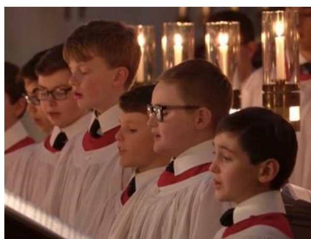
Choristers in the Chapel of King's College, Cambridge, as seen each Christmas on BBC TV.