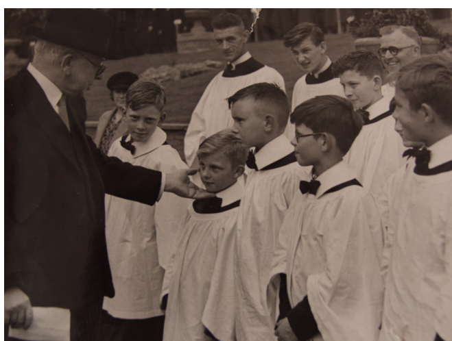
Rotherham Minster Choristers from the late 1940s/early 1950s meet, a government minister.