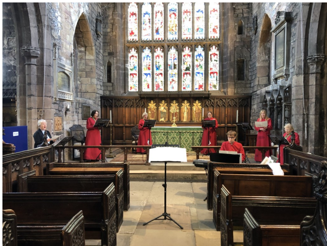
Adult Minster Choir singers rehearse prior to Choral Evensong, under Coronavirus restrictions in June 2021