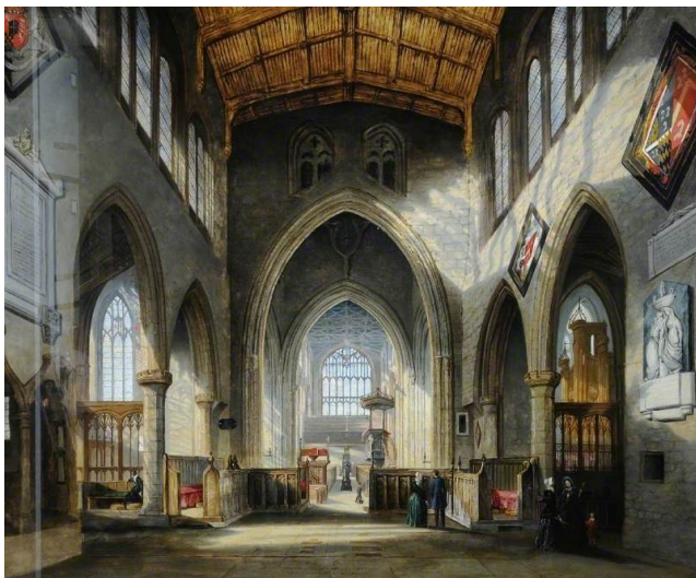
A Painting of the interior of the Minster in 1848, by William Cowen. The view is from the High Altar looking West towards the back of the church.