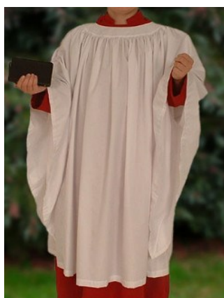
A surplice is worn over the cassock during services

The next step will be for your child to have an induction and become a ' probationer '. The term probationer refers to choristers who are in the first months of being part of the choir. During this period they will attend rehearsals and start to learn the skills they will need to sing as part of a church choir. At first, the children will be invited to attend services with a parent or other adult and sit in the main body in the church as part of the congregation. This will help them get to know what happens in the church during a service and for children who aren't used to church, to become comfortable with being in the building.