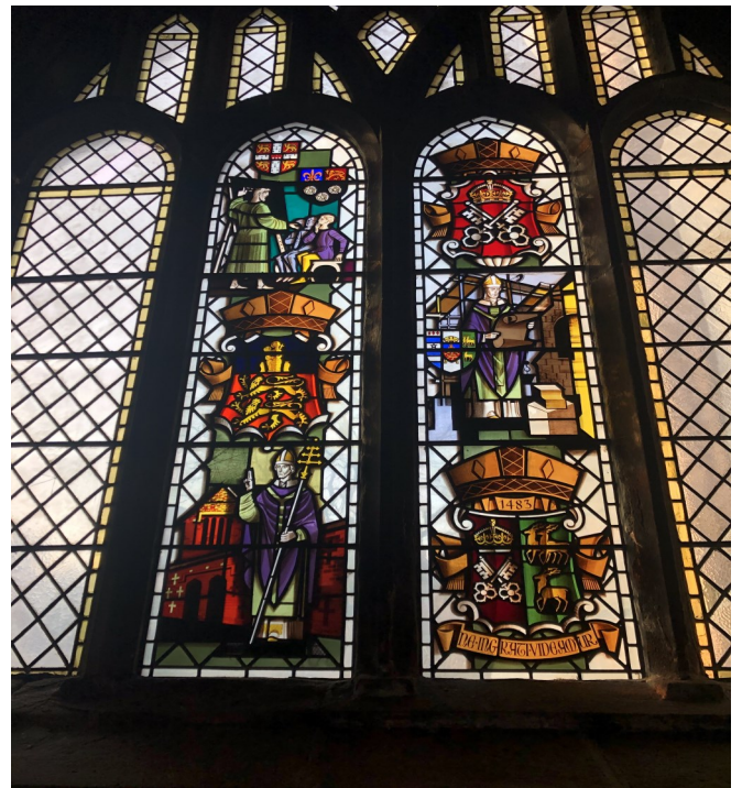
A window in the Jesus Chapel commemorates the founding of the College of Jesus. At the top left, three of the choristers can be seen being instructed by a Master.

The college of Jesus was dissolved many years ago, but the tradition of choral worship at the Minster continues.