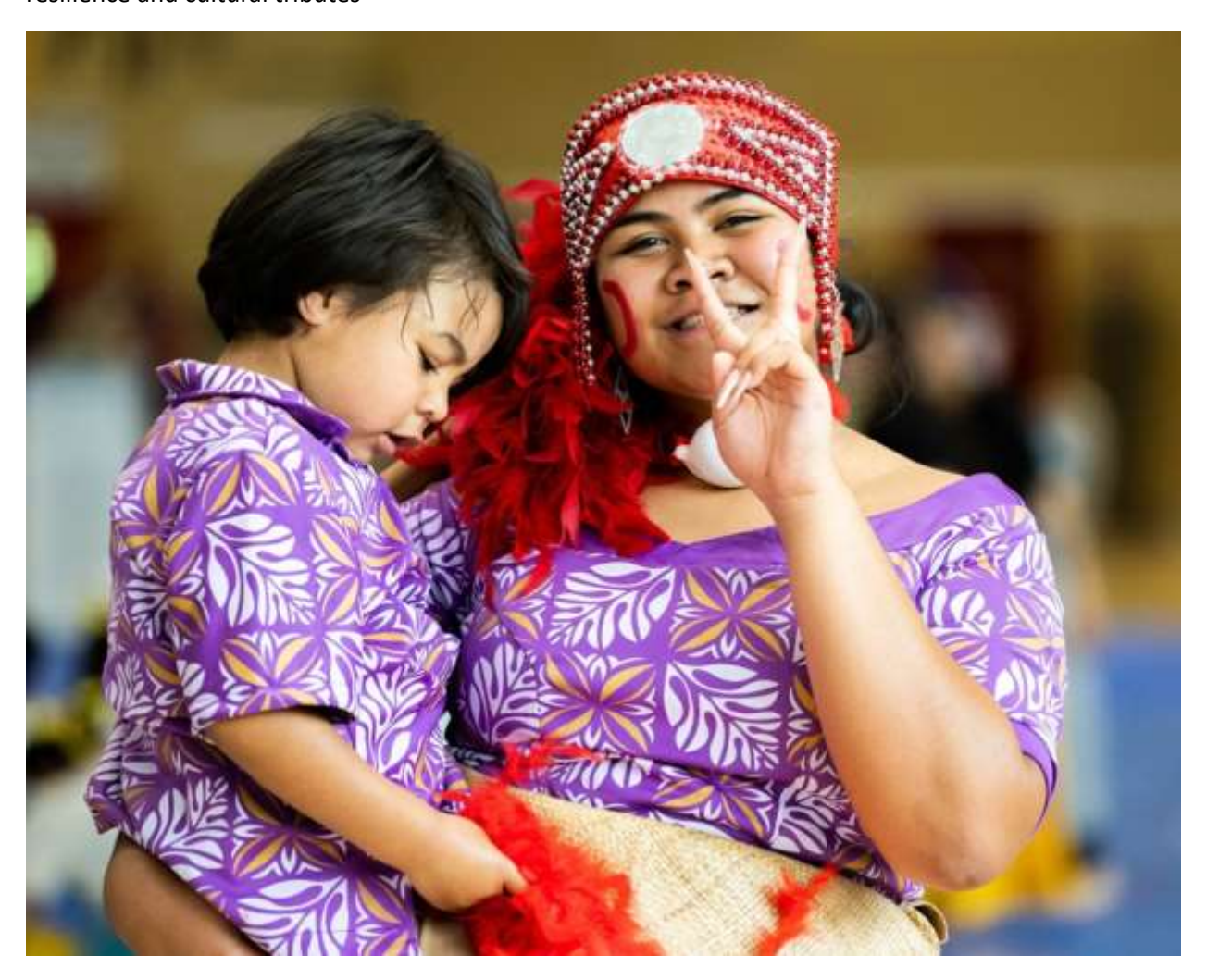
1 / 12 Show Caption + U.S. Army Garrison Rheinland-Pfalz held an Asian American and Pacific Islander (AAPI) Heritage Month event at the Hall of Champions on Smith Barracks in Baumholder, Germany, May 23. Many performers took the stage to celebrate by dancing in different styles, showcasing the diverse cultures of the AAPI community. VIEW ORIGINAL