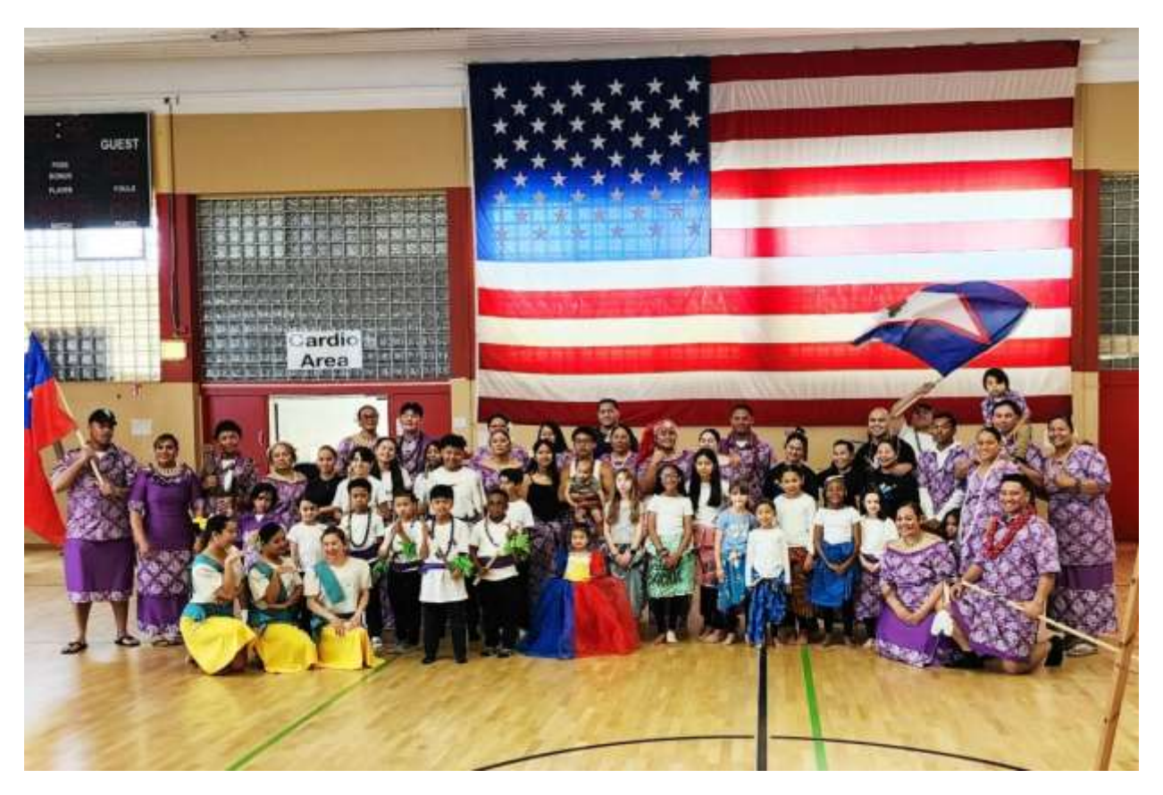
2 / 12 Show Caption + VIEW ORIGINAL