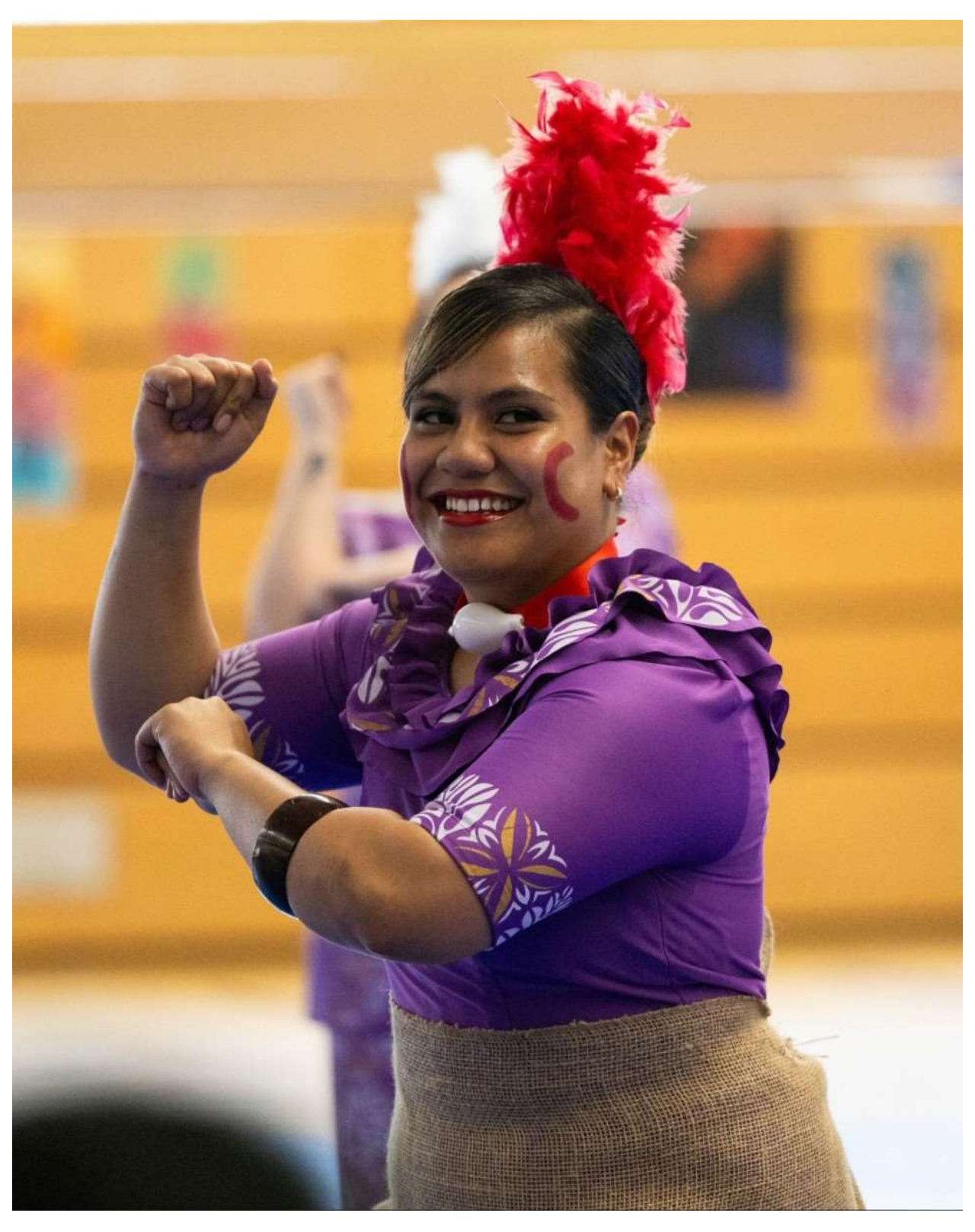
11 / 12 Show Caption + U.S. Army Garrison Rheinland-Pfalz held an Asian American and Pacific Islander (AAPI) Heritage Month event at the Hall of Champions on Smith Barracks in Baumholder, Germany, May