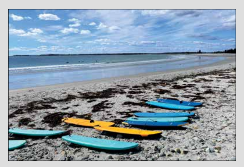
Beautiful Cherry Hill Beach Nature Reserve

Introducing Netukulimk 12, a new environmental stewardship course which blends Mi'kmaw and Indigenous knowledge with Western Science using land-based learning approaches.