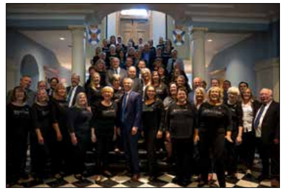
Seaside A Cappella – visit to Legislature October 26.